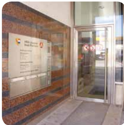
Jobcenter Luisenstr. 29, 75175 Pforzheim