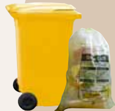
Yellow bin Yellow bag for packaging made from metal, plastic or composite material