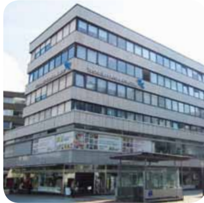
Jugend- und Sozialamt Marktplatz 4, 75175 Pforzheim