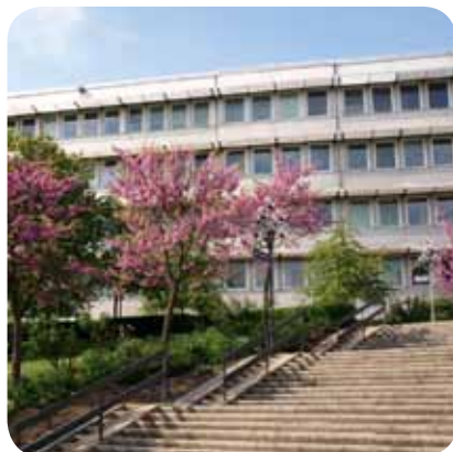
Jobcenter Blumenhof 4, 75175 Pforzheim