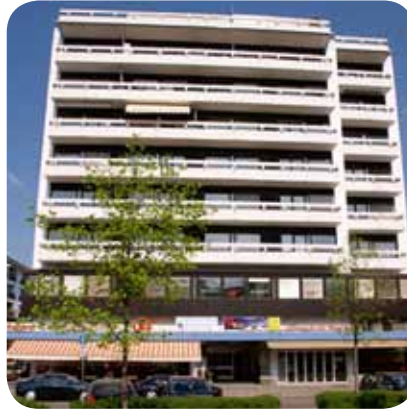
Jugend- und Sozialamt Zehnthofstr. 10, 75175 Pforzheim