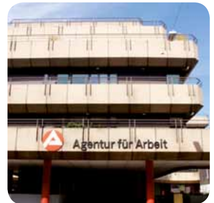
Agentur für Arbeit Luisenstr. 32, 75172 Pforzheim