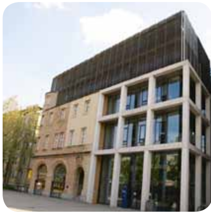
Altes Rathaus Östliche Karl-Friedrich-Str. 2, 75175 Pforzheim