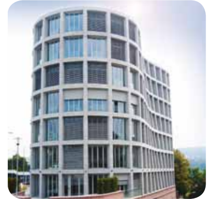
Amt für Bildung und Sport Lindenstr. 2, Room 1.21, 75175 Pforzheim