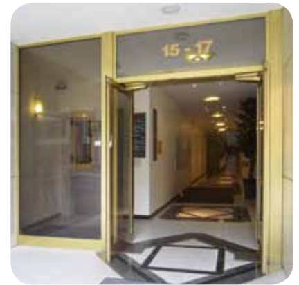
Koordinierungsstelle Sprachkurse Schlossberg 15, 75175 Pforzheim