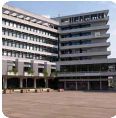
Neues Rathaus Marktplatz 1, 75175 Pforzheim